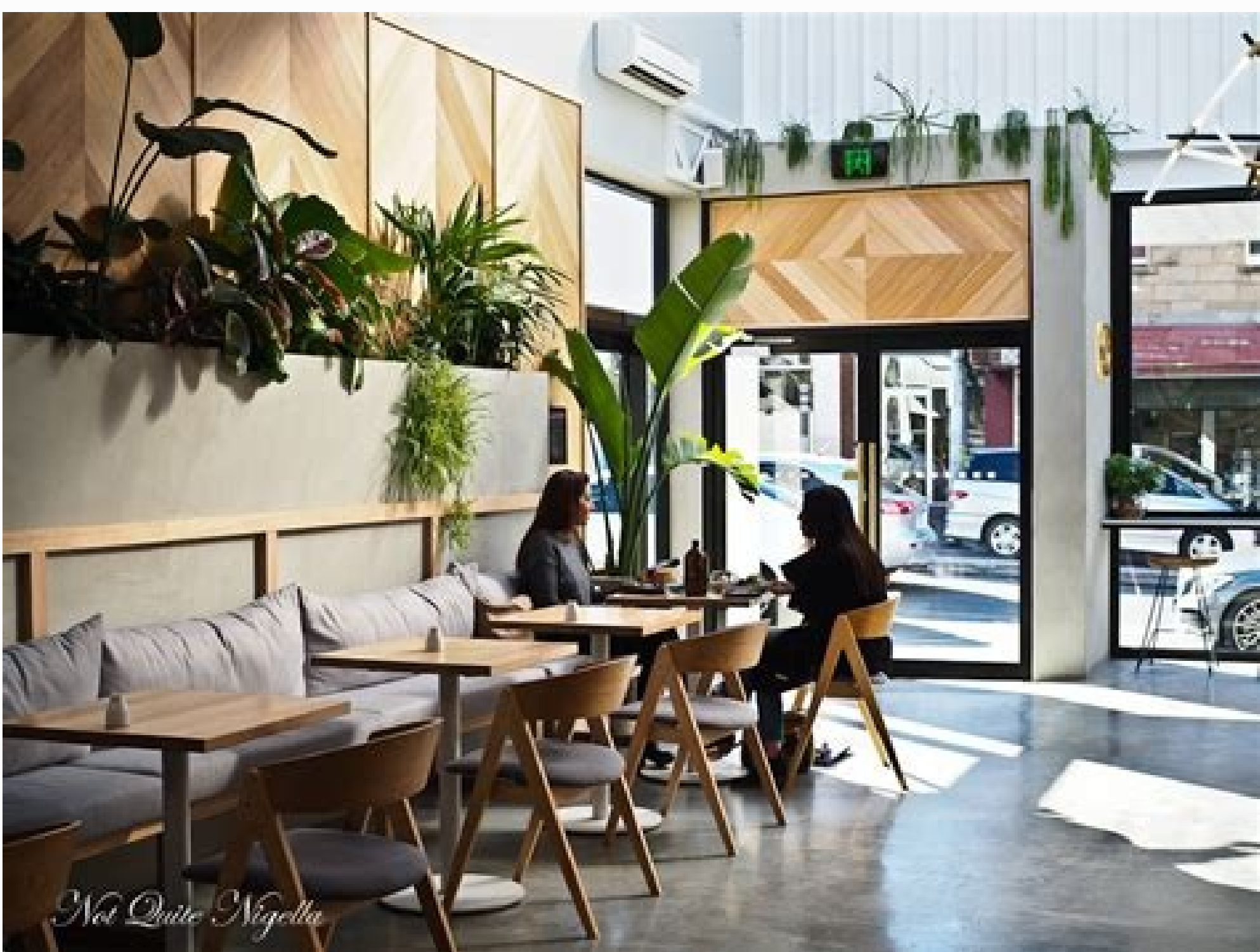
Not Quite Nigella