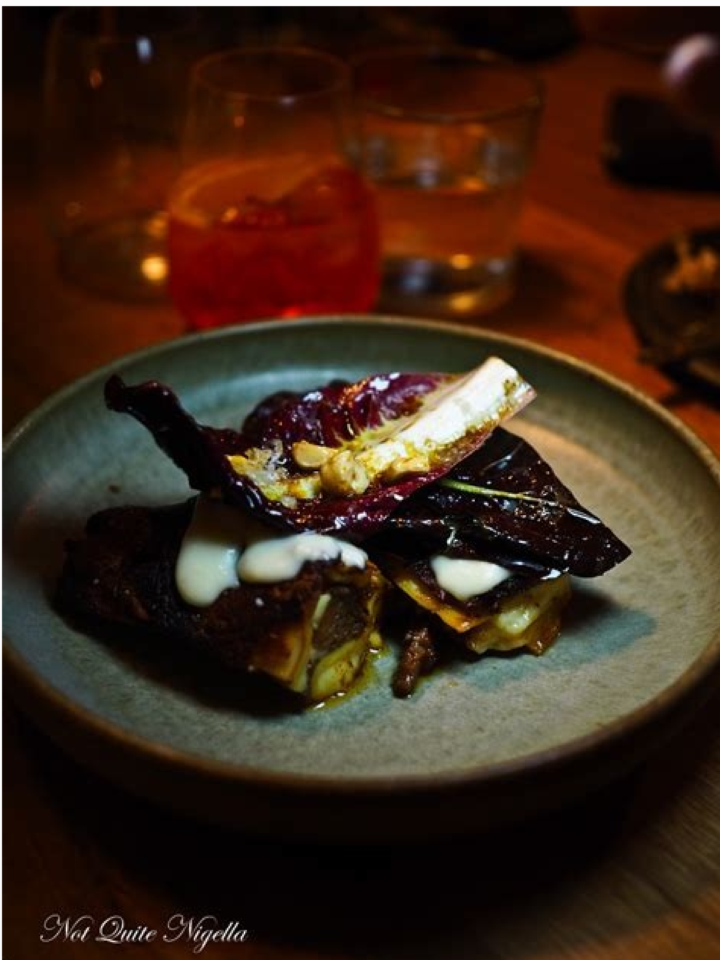
Not Quite Nigella